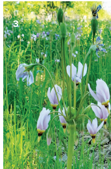
(Photos) 1. Cypress trees on the lower Cache River in southern Illinois 2. Mike and Joann hug a chinkapin oak at White Tail Glade in southwest Illinois 3. Shooting star in flower at Jo Daviess Conservation Foundation's Rutherford Refuge at Twin Bridges Property in northwest Illinois